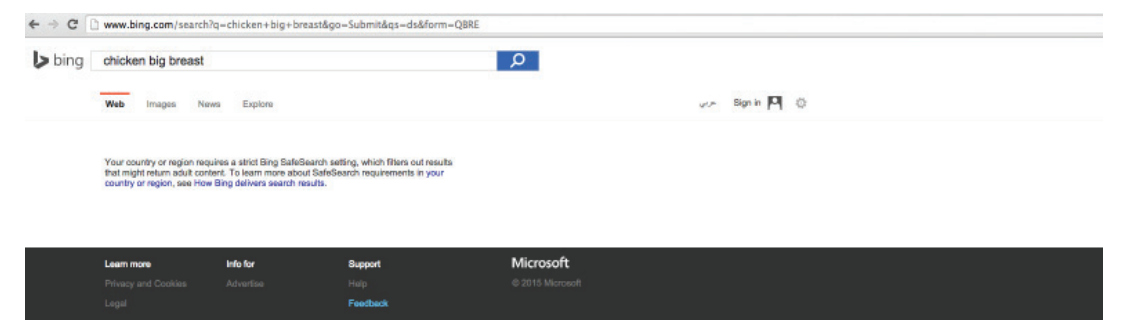
Screenshot: Bing's SafeSearch setting.

countries into markets, resulting in policies predicated on the most restrictive country in said market; or a corporation and its employees may place restrictions on content based on their own sense of morality or appropriateness or their perception of what users in a given market want. The impetus behind such content restrictions can be difficult to ascertain, and may involve a combination of the above.