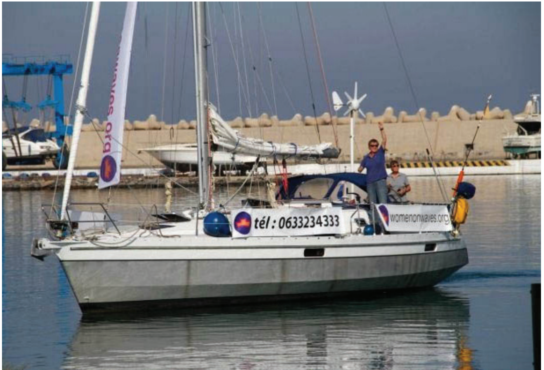
The Women on Waves sailing vessel is subject to Dutch law. According to Dutch law, a medical practitioner must have a licence to terminate a pregnancy if the woman's menstrual period is more than 16 days late. For pregnancies of less than 6.5 weeks after the previous menstrual period, no licence is needed to administer an early medical abortion.

Today a help desk operates in 12 languages, all hours of the day, and deals with a stream of 8,000 emails per month. The team closely monitors the use of the website and usefulness of the service.